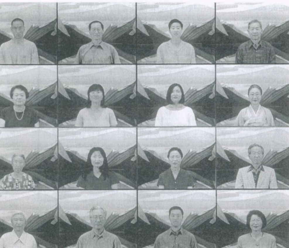
A Group of sixty-seven, 137 colour photographs, 28 x 35.5 cm each, Jin-me Yoon, 1995.